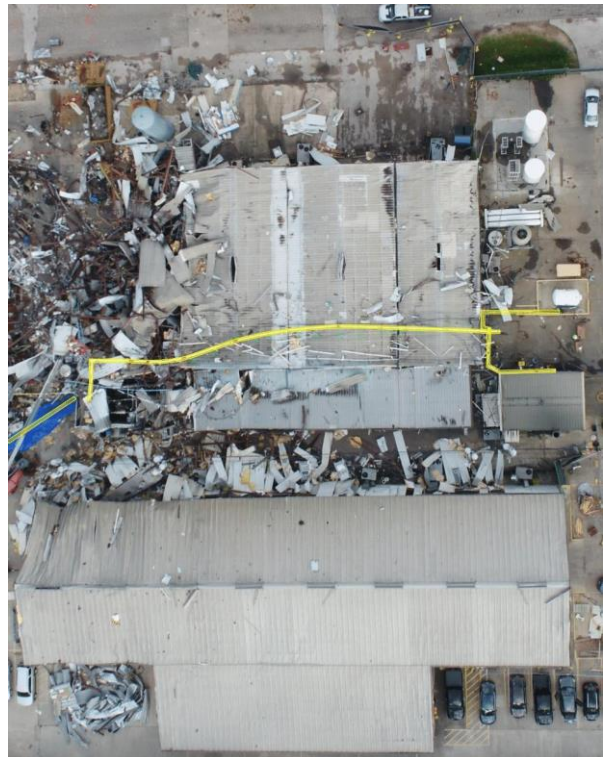
Pre and Post explosion aerial photos of Coating building (left) and ball lapping building/machine shop (right) with Propylene pipe remains highlighted in yellow. (Propylene piping denoted in the Pre-incident photo in red)